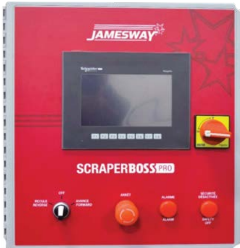
Scraper-Boss PRO Master control