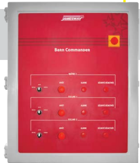
Barn Commander. Connects to motors, actuators & sensors.

Collection gutters, agitators, valves, and pumps can be easily automated using the integrated Barn Commander control in every Jamesway Scraper-Boss PRO. The large display graphics make it easy to understand and adjust.