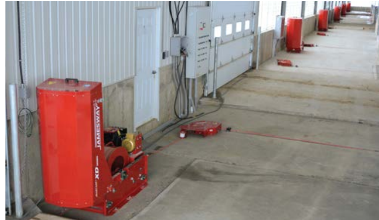
The Jamesway Scraper-Boss PRO can operate up to 4 alley scrapers.