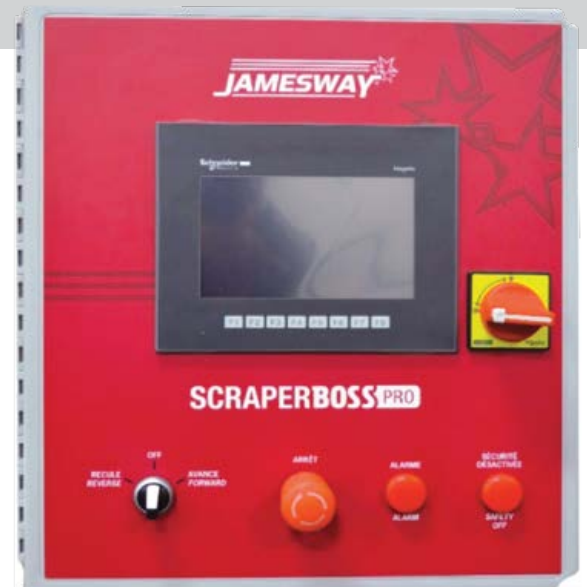
Scraper-Boss PRO Master control