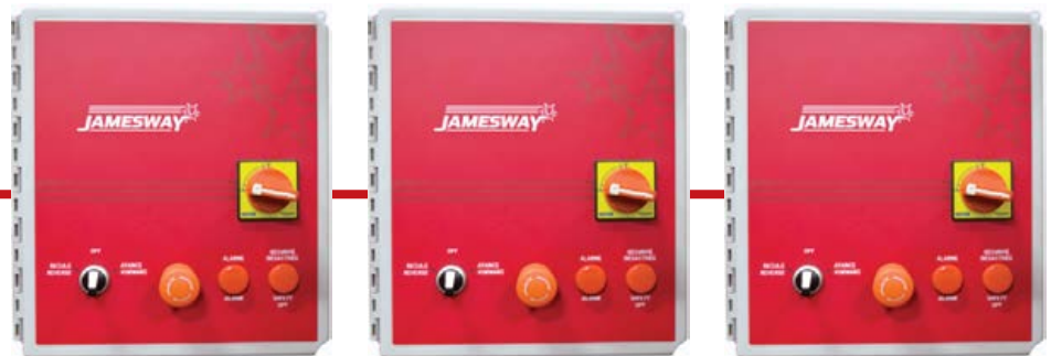
Slave controls for additional scrapers, maximum 3.

Jamesway's reliable counter system continuously keeps track of the blade position. Sensors are mounted high & dry for maximum life.