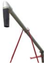
TANKER LOADING KITS 6" or 8" bipod