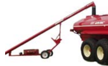
TANKER LOADING KITS trailer loading cart